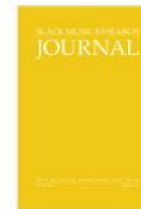
Black Music Research Journal