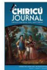
Chiricú Journal: Latina/o Literatures, Arts, and Cultures